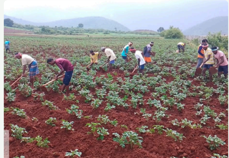
Potato weeding at Maa Kantabausuni PG of Purimunda village of Podagada GP in Dasamantapur Block of Koraput.