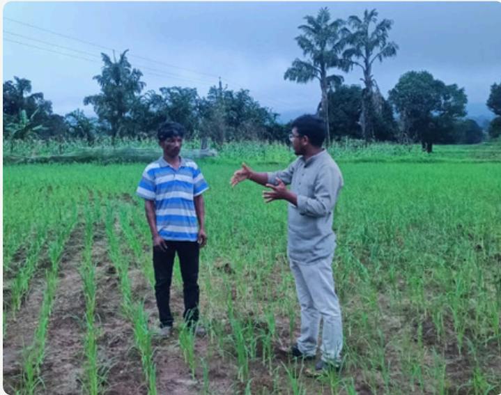
Finger Millet (Ragi) Field visit at Kallar GP of K.Padapadar village in Boipariguda block, Koraput