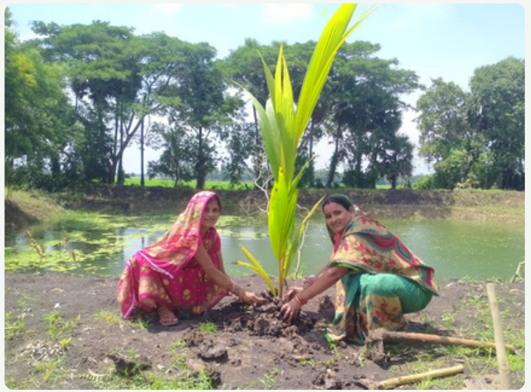
Coconut plantation on Community Pond embankments in Delang block, Puri district