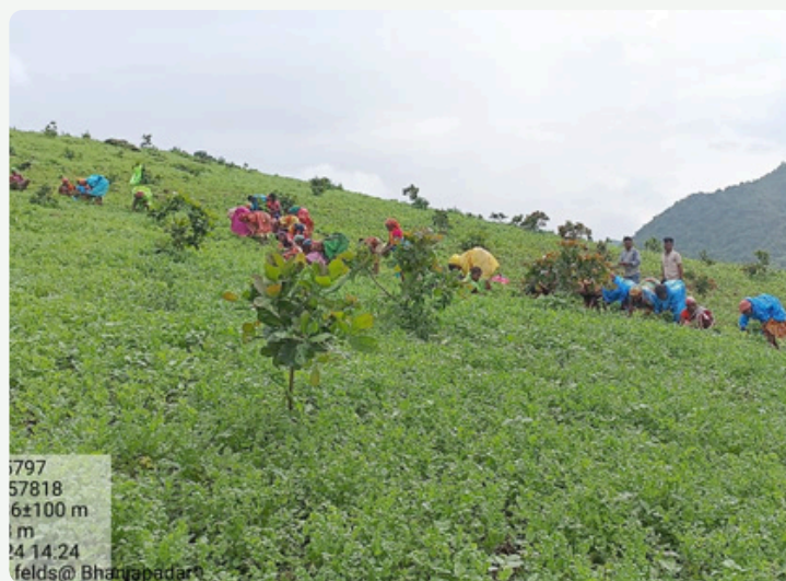
Coriander collective marketing by Deomali PG of Bhanjapodar village of Podagada GP in Dasamantpur Block of Koraput.